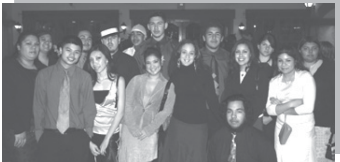
The first annual Southern California College Tour for Silver Creek's Academy took place in spring of 2005. The students are dressed up for a formal dinner at Black Angus after touring USC last year.

What's most amazing about this event is that for most students it's the first time they've traveled out of their home area. A lot of students don't get a chance to visit any colleges even close to home, so the trip really has the potential to open their eyes to the different options they may not realize they have. Overfelt's Academy has been going on the Southern California College Tour every year for the past fourteen years, and the Silver Creek Academy is looking forward to taking students on the tour for just as long!