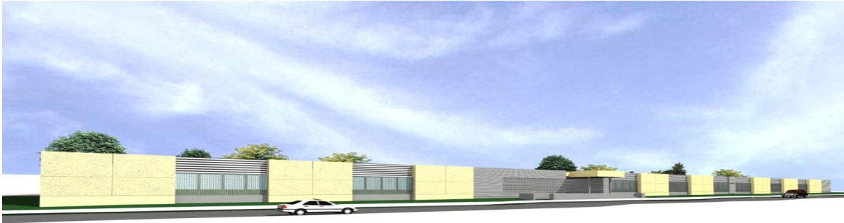
New Buildings S & T Rendering

The project includes two new one story science & classroom buildings, associated site work & utilities, parking lot alterations, ADA path of travel upgrades, & landscaping.